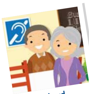
Deaf or hard of hearing