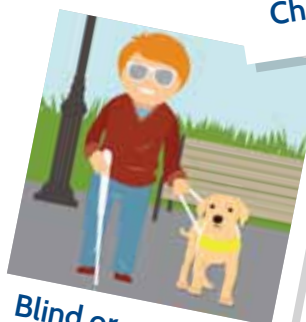
Blind or partially sighted